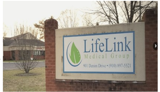
LifeLink Medical Group sign outside of their office building.

LifeLink's providers were engaged, asking pertinent and relevant questions. A fol-