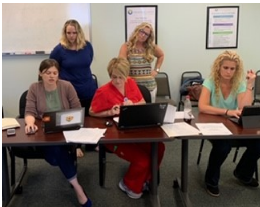
Staff from Granville Vance Public Health and Daymark Recovery work together to improve care.

The ability to connect primary care clinicians to their local behavioral health agencies has been a priority.